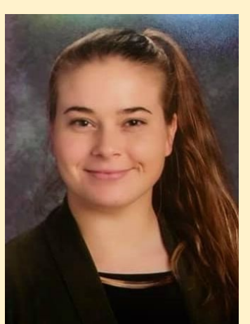
7th Grade AVID AVID Coordinator