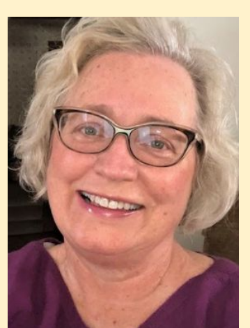
8th Grade AVID